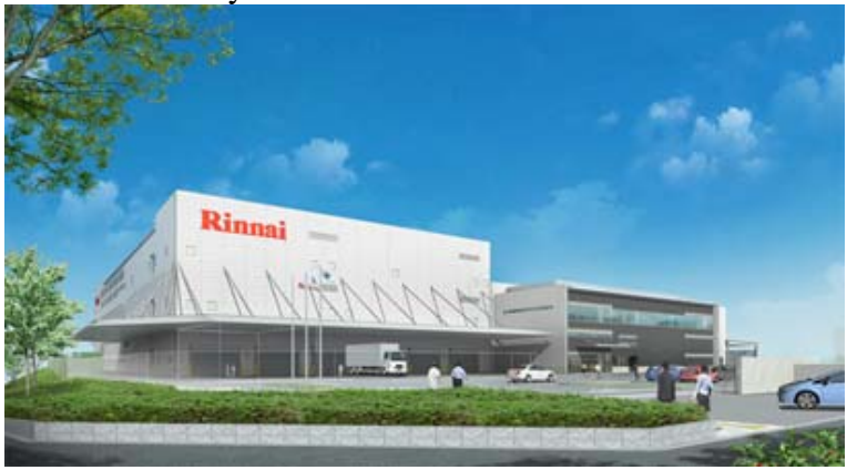
Image of completed No. 2 Wing (left) and No. 3 Wing (right) at Akatsuki Plant

Rinnai Corporation, a comprehensive manufacturer of heat and energy appliances, has decided to construct two new buildings (No. 2 Wing and No. 3 Wing) on the site of its Akatsuki Plant (Seto City, Aichi Prefecture). The aim of the project is to increase the production capacity of Rinnai's ECO ONE hybrid water heater with heating system, as well as bathroom heater/dryers and other hot water terminals, and to increase overall production efficiency.