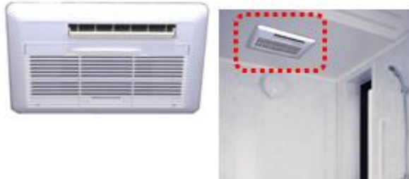
External view of equipment concerned