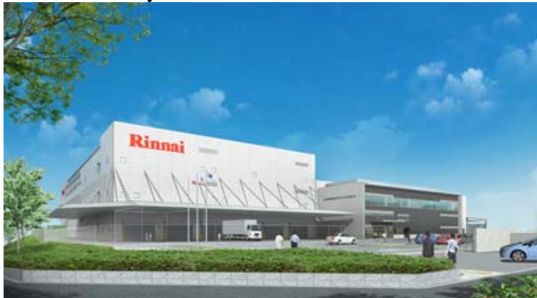
Image of completed No. 2 Wing (left) and No. 3 Wing (right) at Akatsuki Plant

Rinnai Corporation, a comprehensive manufacturer of heat and energy appliances, has decided to construct two new buildings (No. 2 Wing and No. 3 Wing) on the site of its Akatsuki Plant (Seto City, Aichi Prefecture). The aim of the project is to increase the production capacity of Rinnai's ECO ONE hybrid water heater with heating system, as well as bathroom heater/dryers and other hot water terminals, and to increase overall production efficiency.