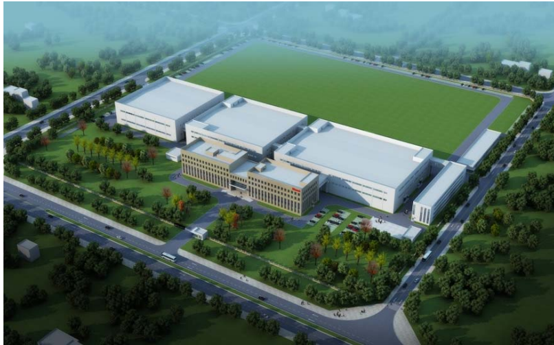
Image of the new Fengxian Plant

Shanghai Rinnai Co., Ltd. has decided to construct a new factory in the Fengxian District of Shanghai, China, in anticipation of future expansion of the Chinese market. Shanghai Rinnai is a consolidated subsidiary of Rinnai Corporation, a comprehensive manufacturer of heating appliances dedicated to benefitting people's lives.